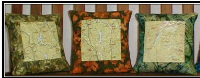
Topographic Fabric Pillows with "Batik" Borders