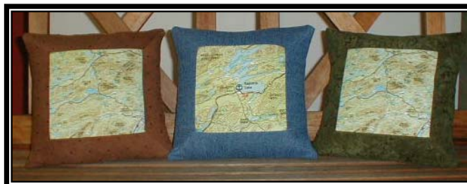
Topographic Fabric Pillows with "Tone on Tone" Borders