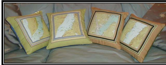
Topographic Fabric Pillows with "Frame" Borders