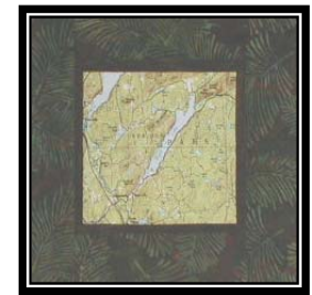
Single Map Wall Hanging