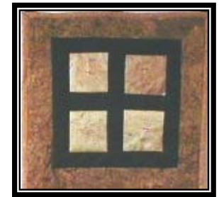
Four Patch Wall Hanging