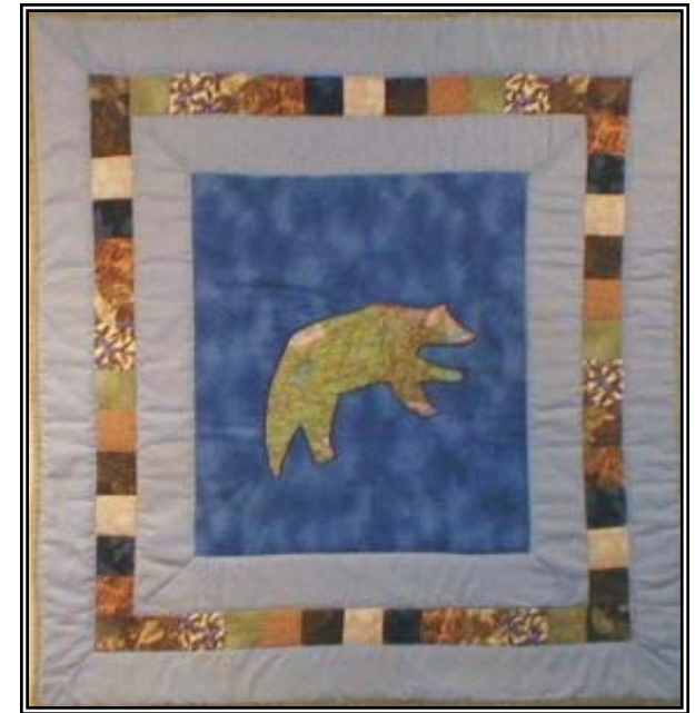
"Bear Mountain" 42" x 48" Quilt

FOR MORE INFORMATION ON THESE AND OTHER PRODUCTS :